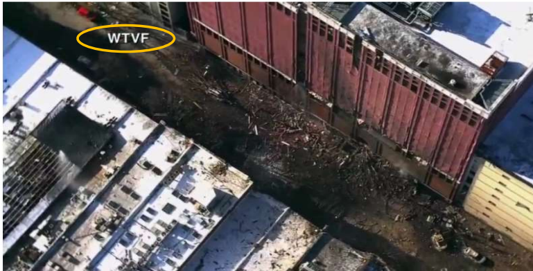
nashville explosion social media video nr vpx_00010816.png

A Christmas morning explosion that rocked downtown Nashville, injuring at least three people and damaging dozens of buildings, is believed to be an intentional act, authorities said.