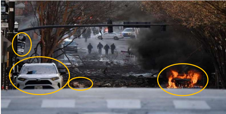
A vehicle is on fire after an explosion in Nashville on Friday, December 25, 2020.

CNN's parent company, WarnerMedia, is owned by AT&T.