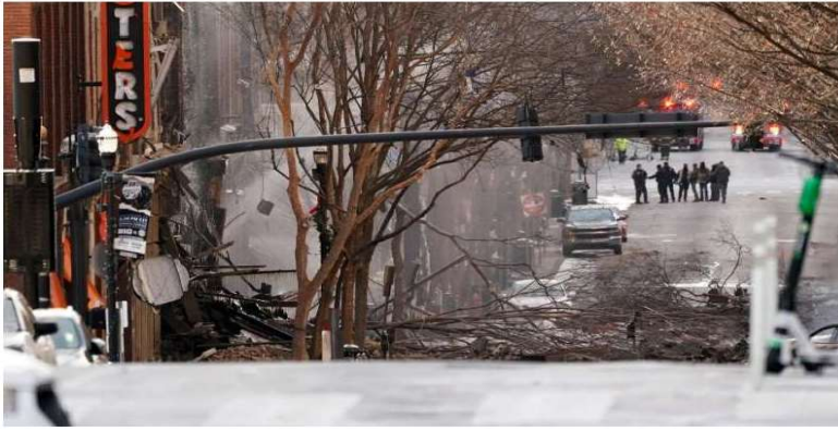
Emergency personnel work at the scene of the explosion.

Acting US Attorney General Jeff Rosen was briefed on the incident, according to his spokesman, "and directed that all DOJ resources be made available to assist in the investigation."