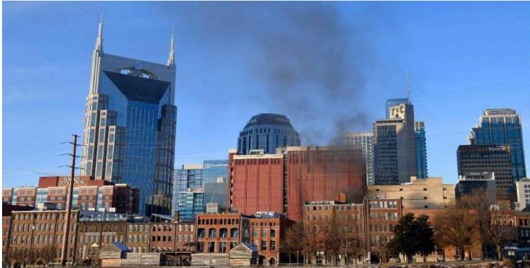
Smoke rises from downtown Nashville after an explosion.

Tennessee Gov. Bill Lee said in a statement on Twitter that the state would "supply all the resources needed" to determine the cause of the explosion.